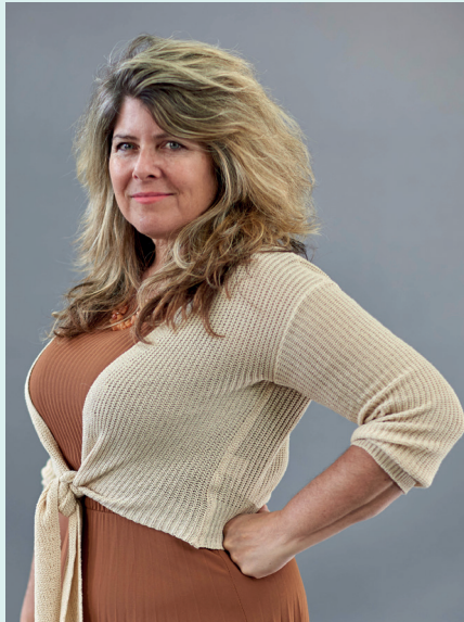
Naomi Wolf described the covid vaccine rollout as premeditated “mass murder” on a GB News show

It came to the same conclusion after assessing an episode of Lorraine in which Hilary Jones (right), a GP, made comments about the number of unvaccinated people, making it the sixth most complained about programme in 2021.